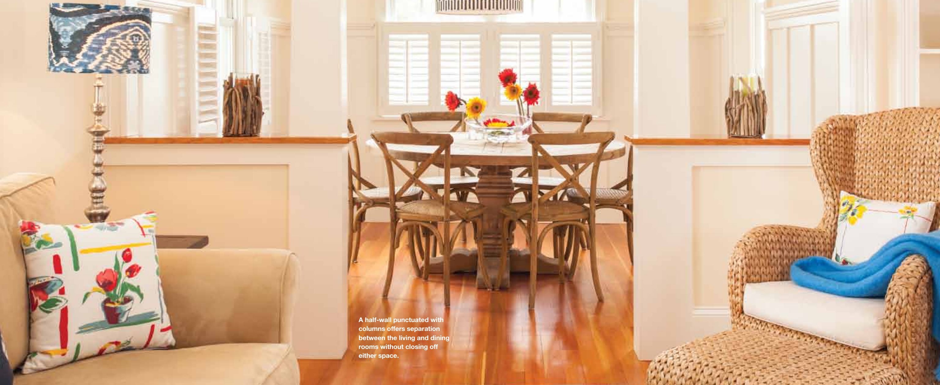
A half-wall punctuated with columns offers separation between the living and dining rooms without closing off either space.

The large kitchen on the back of the house is every home chef's dream, with a Viking six-burner professional gas stove and a Liebherr built-in refrigerator that matches the white cabinetry. Countertops are jet mist granite that has been "leathered" to give them the look and feel of soapstone without the maintenance. A butler's pantry with plenty of built-in storage and a wine rack separates the kitchen from the adjoining dining room.