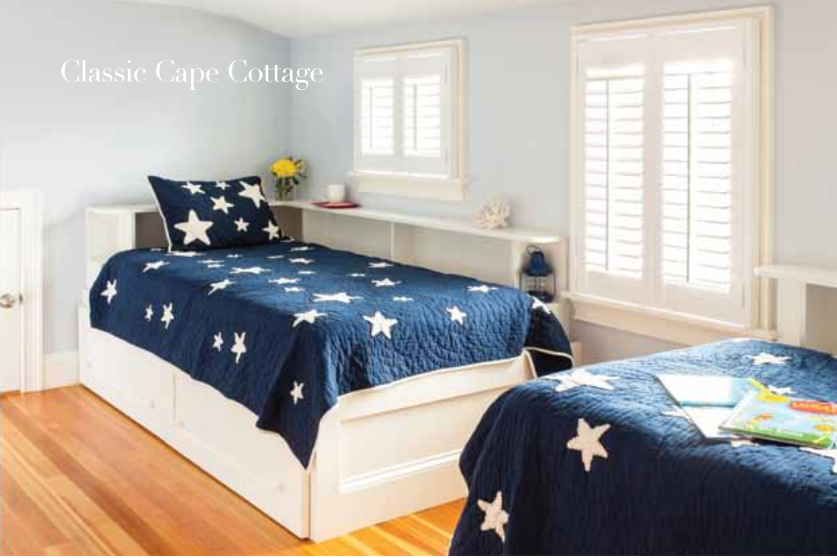
Above: Ship's-style bunks were used in the boys' room to save space and create storage. At right: The master bedroom, with an en suite bath, opens off the living room.

The first floor master bedroom can be accessed either through a full bathroom off the kitchen or through a door off the living room. Pale blue walls create a calming effect and plantation shutters offer privacy.