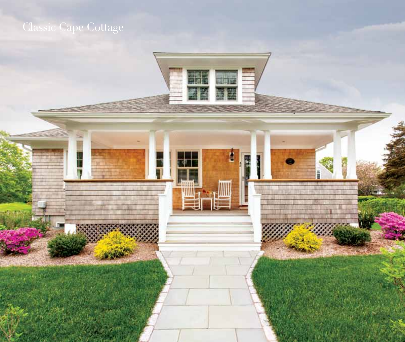
The front of fully restored Sears 'kit house' in Chatham's Old Village. The completed renovation garnered a Chatham Preservation Award from the Chatham Historical Society.

From 1908 through 1940, Sears, Roebuck and Company sold close to 75,000 homes through their "Modern Homes" mail order program. This hip roof bungalow, circa 1915, is one of several Sears homes that exist in the Old Village of Chatham. When the present homeowners bought it, it hadn't been updated since the 1930s. Despite the run-down condition of the house, the owners were attracted to the property because of its close proximity to the downtown area and the unique style of the house. They hired Minglewood Homes in Chatham to completely refurbish the home.