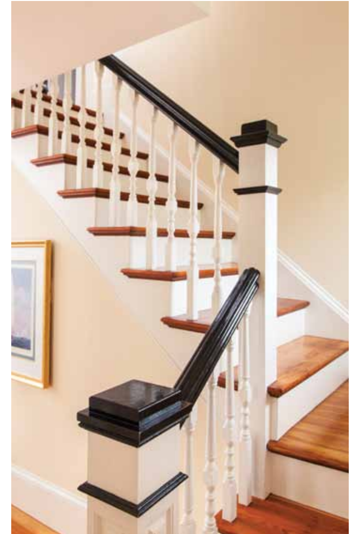
The home's original staircase was fully restored; black high-gloss paint was used to highlight the charming details.

When the Minglewood crew gutted the upstairs, they discovered there had been a fire at some point. They found smoldered rafters with a few burned straight through that had to be replaced. The original second floor had a couple of tiny warren-like bedrooms. To create more space, Smith added dormers and cantilevered the roofline. The three bedrooms are still small, but have storage cubbies and features like built-in beds to maximize space and create a cozy feeling. There is also a new full bath on the second floor.