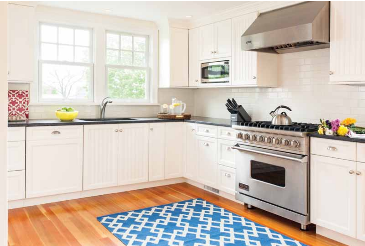
The white cabinetry and white-tiled backsplash used in the kitchen make the room feel airy; a black countertop offers contrast. Above: A space-saving two-door refrigerator.

"Then we gutted the whole house and tried to rematch some things that were here," Smith says. "The layout on the first floor is a little bit different. It's not a huge house, so you really had to work with what you had."